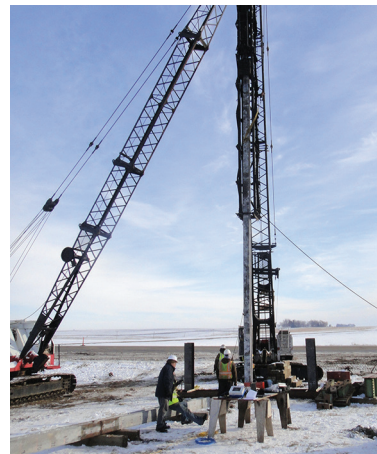
UHPC pile driving in the field

The UHPC test piles were driven after installation of the reaction-frame-anchor steel piles. While the lateral load test pile sustained no visible damage at the head after driving, slight damage was observed on the vertical load test pile.