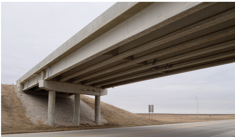
Abutment where UHPC pile was installed in Sac County, Iowa

UHPC is a cement matrix often used with steel fibers, and it has several advantages over other materials often included in bridge foundations. These advantages include strength, ductility, durability, and aesthetic design flexibility, which are achieved by eliminating the characteristic weaknesses of normal concrete.