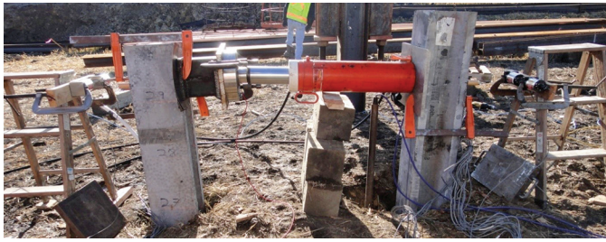
Lateral load testing of a UHPC pile

The UHPC production pile was built, instrumented, and installed in the foundation of an actual integral bridge abutment. The pile was monitored over a period of 32 months to evaluate its performance under time-dependent cyclic lateral movements. Three of the HP 10 × 57 piles supporting the bridge abutments were also instrumented and monitored so that their performance could be compared with that of the UHPC pile.