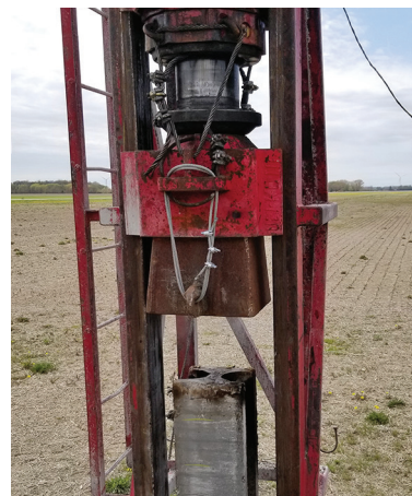
UHPC pile toward the end of driving