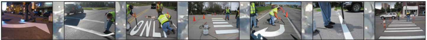
Transverse marking installation and performance demonstrations