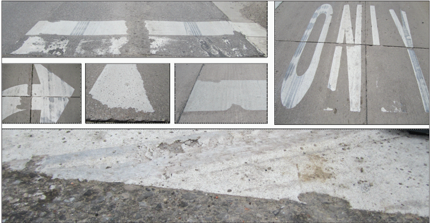
Transverse marking wear and snow plow damage

Concrete surfaces require the use of a primer, which can slow the installation process, and more failures occurred on concrete surfaces than on asphalt. The cooling time for these markings can be accelerated, versus waiting for paint to dry, in humid and cloudy conditions.